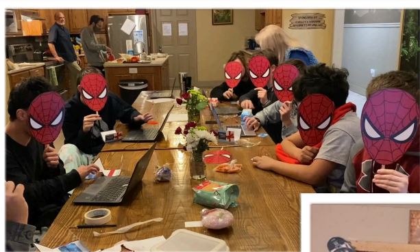
South Forsyth teens receiving our gift cards