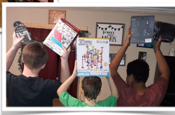
Barrow Jackson teens showing gifts they purchased with our gift cards